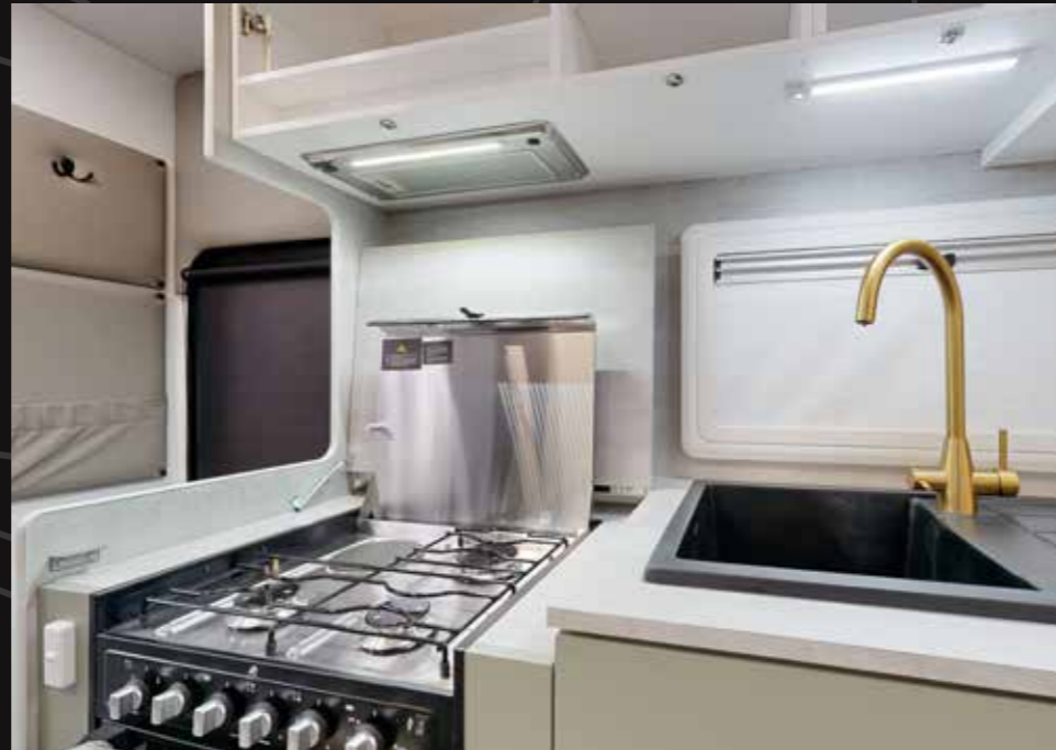
*Optional Gold Tapware Shown