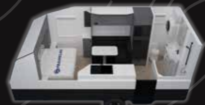
176* Highlights: Features L-Shape Lounge Spacious Queen Size Bed