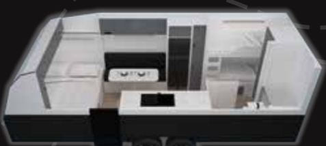
206 Family Highlights: Choice of Double or Triple Bunkbeds