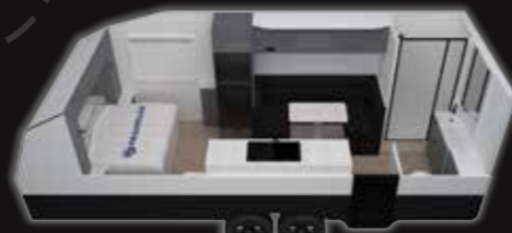
206 Highlights: Features Club Lounge Spacious Queen Size Bed