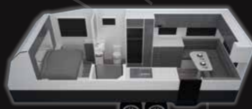
225CL Highlights: Luxurious Rear Club Lounge Spacious Queen Size Bed