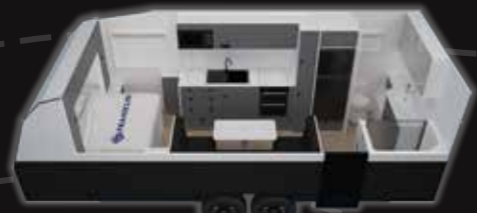
205 Highlights: Choice of Club or Café Lounge Spacious Queen Size Bed