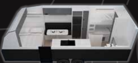
210 Family Highlights: Choice of Double or Triple Bunkbeds