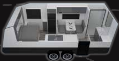
196 Highlights: Available with Single Beds