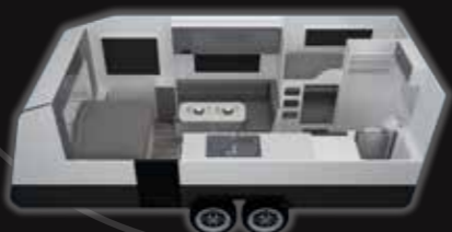
196 Family Highlights: Features Double Bunkbeds