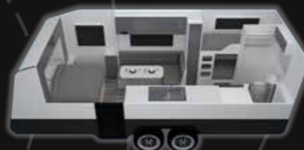
206 Family Highlights: Features Double Bunkbeds