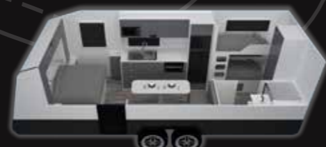
215 Family Highlights: Choice of Club or L-Shape Lounge Choice of Double or Triple Bunkbeds