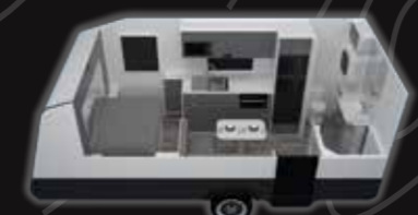
176LS* Highlights: L-Shape Lounge with Double Bed or Café Lounge with Single Bed