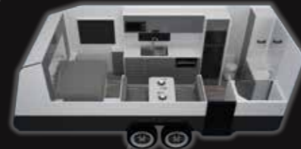
206 Highlights: Choice of Café or L-Shape Lounge Single Bed Option